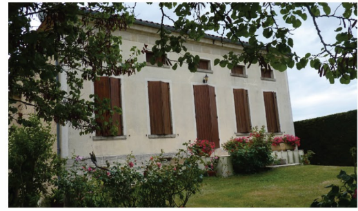
GAEC Gobelet Bois Redon - Cours de Monsegur